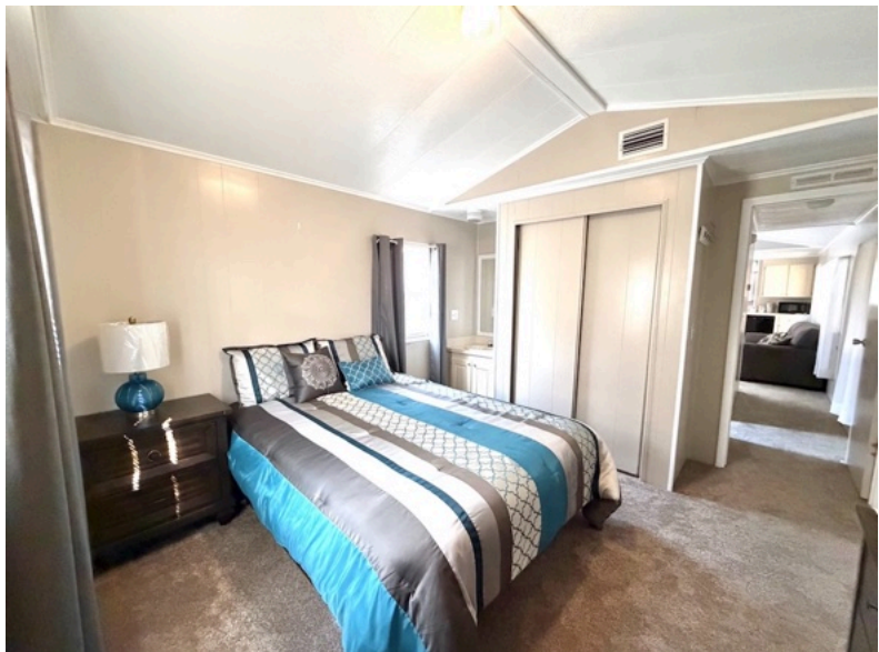
Images shown above are of a staged model cottage and are for illustrative purposes only. Finishes, layouts, furnishings, bedding, decor, and other items depicted may not be included in the actual residence. Please consult a leasing representative.